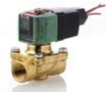
1/2" Class II G Solenoid